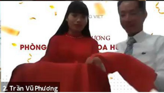
A virtual ceremony was held to celebrate the opening of Hung Viet General Clinic. 2020-08-06 15:19:44